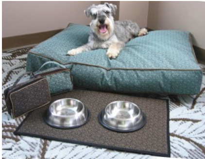
Hilton Atlanta - Atlanta, Georgia

Even industry giant Hilton says yes to pets. Upon check-in, you'll receive a welcome package featuring a travel tote, organic treats, biodegradable waste bags, and a travel-size bottle of one-step cleaner for smells and spills. They also offer a Crypton Clean Pet Pillow, designed by famed photographer William Wegman.