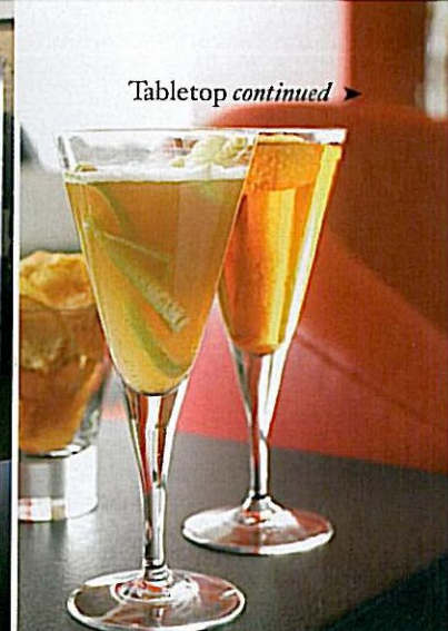
Tabletop continued ▶